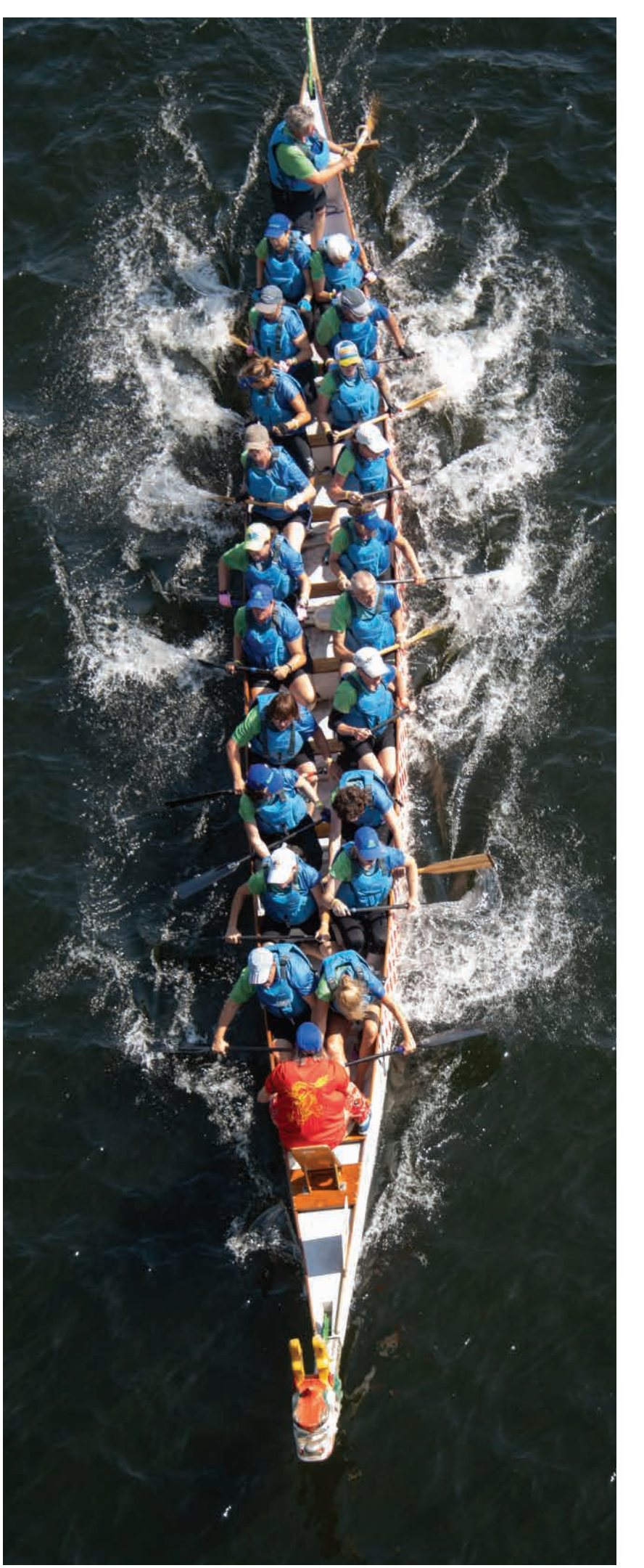
RIVERFRONT RECAPTURE 50 COLUMBUS BOULEVARD, FIRST FLOOR HARTFORD, CT 06106