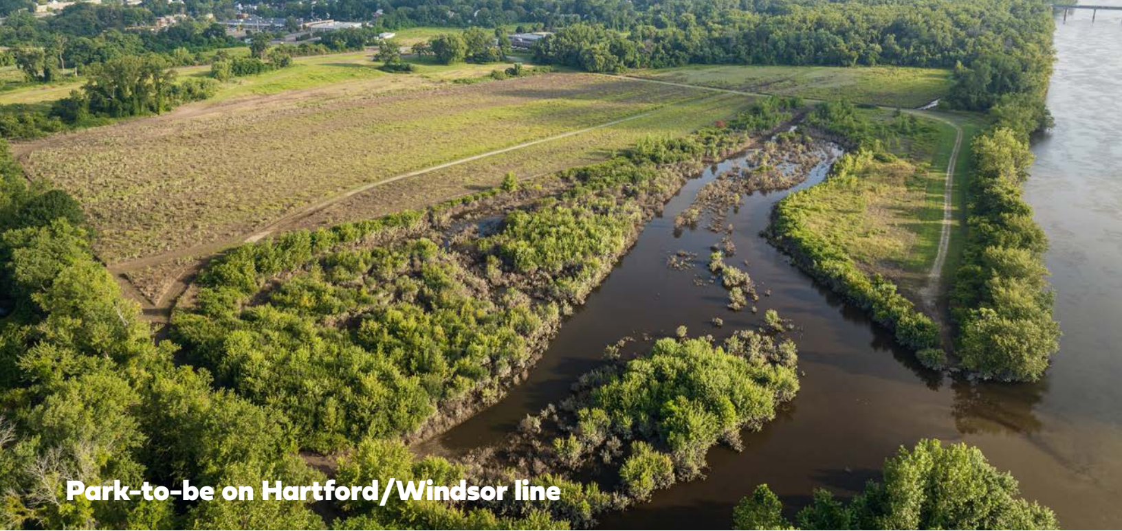
Park-to-be on Hartford/Windsor line