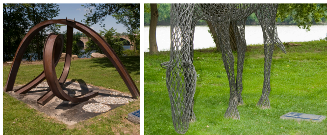
Sculptures shown: Secession (6), Jack (7), Union (10), Steamer (9), Toward Union Lines (4), Transcontinental (15), Circuit Rider (13)

Lincoln Financial provided funds in 2005 to the Greater Hartford Arts Council, in partnership with Riverfront Recapture, to design a sculpture walk along the Connecticut River in both Hartford and East Hartford.