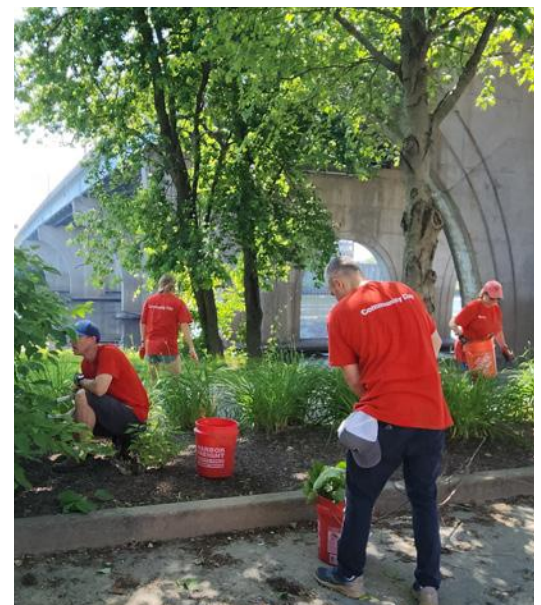
by row, l to r: The Big Mo' Committee, Riverfront Park Ranger, relaxing moment, our future park, fishermen with striped bass, Swiss Re volunteers