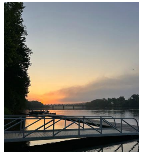
by row, l to r: Bulkeley Bridge-rowers, Hartford HealthCare volunteers, Hartford HealthCare 5k, Hartford to Wethersfield Riverwalk Feasibility Study presentation by planning consultant VHB, Bank of America Military Appreciation walk, sunrise from Riverside Park