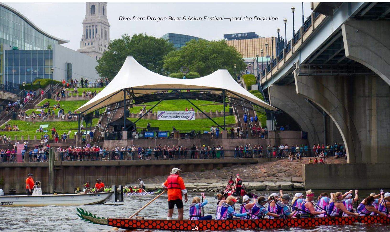
Riverfront Dragon Boat & Asian Festival—past the finish line

This summary is derived from the audited financial statements for the year ended December 31, 2025. A copy of the complete statement is available at riverfront.org/annual-reports-financials/ . Our auditor is CliftonLarsonAllen LLP.