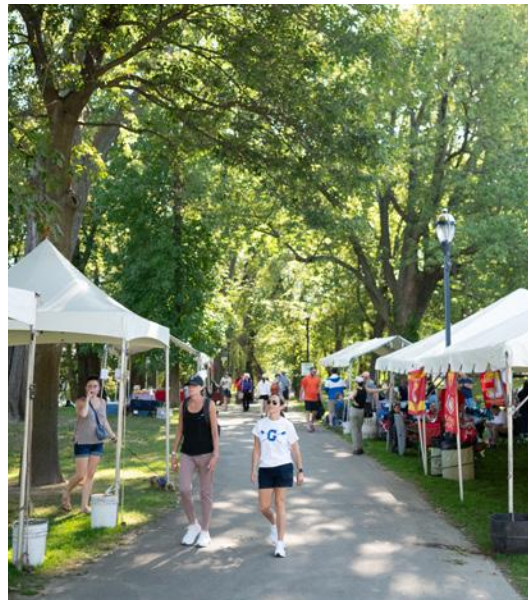
by row, l to r: Canada geese, musical performance, youth rowing, Dragon Dance-Riverfront Dragon Boat & Asian Festival, Head of the Riverfront Regatta food truck and team tents